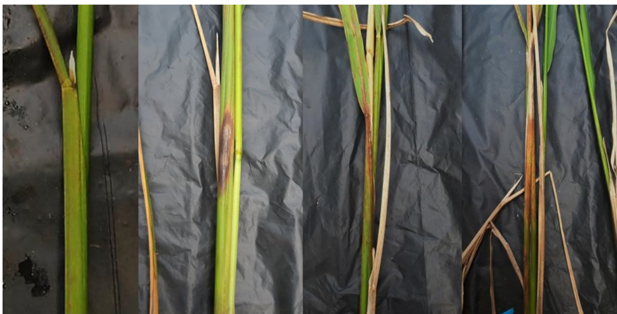
Figure 4. Symptoms on the midrib (A) control treatment and (B) inoculation of B. glumae suspension