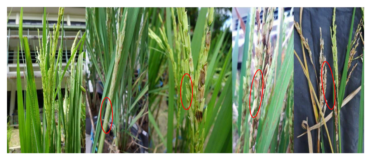
Figure 3. Symptoms development in grains of panicle after inoculation of B. glumae

The initial symptoms that appear on the rice grains are brown spots which then spread to all parts of the grains so that the grains become dry and hollow. The dry, hollow ears fall out, while the green ears begin to show brownish and hollow spots, then a few moments later fall out (Figure 3). The chlorotic symptoms of the panicle and grain rot and reduced leaf and root growth in rice seedlings are caused by the production of toxoflavin and fervenulin which play a very important role in the pathogenicity of B. glumae in rice plants (Jeong et al. 2003).