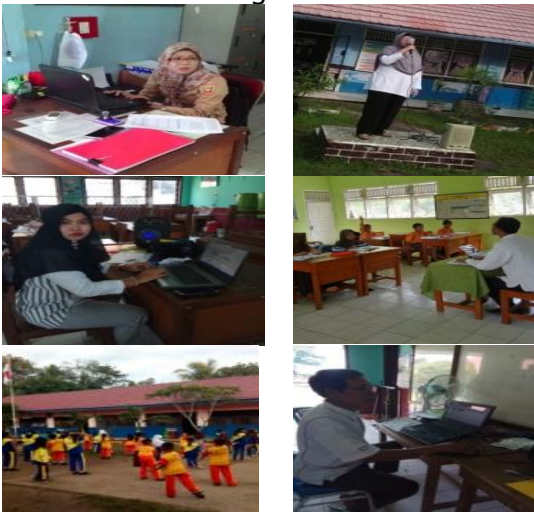
Pictures of teaching activities for teachers at Public Elementary School 2 & Public Elementary School 29 Gelumbang using laptops, speakers, in various teaching and learning activities