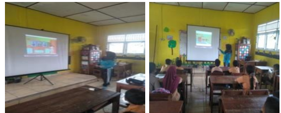
Teachers Picture using Laptop-LCD-LCD-internet