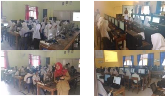
Pictures of students and teachers at the Computer Lab at Senior Secondary School 1 Sungai Rotan

lessons related to computer use such as Indonesian, Science, English, Accounting, Mathematics, and computer extra-curricular lessons such as making videos/movies, etc. Computer labs are also used by teachers and students to access the internet to find references to learning resources related to the subject matter being studied.