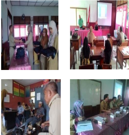
Pictures of teacher ICT competency enhancement activities (seminars, peer tutoring, handover borrow-use school laptops for teachers to use in class, etc.)