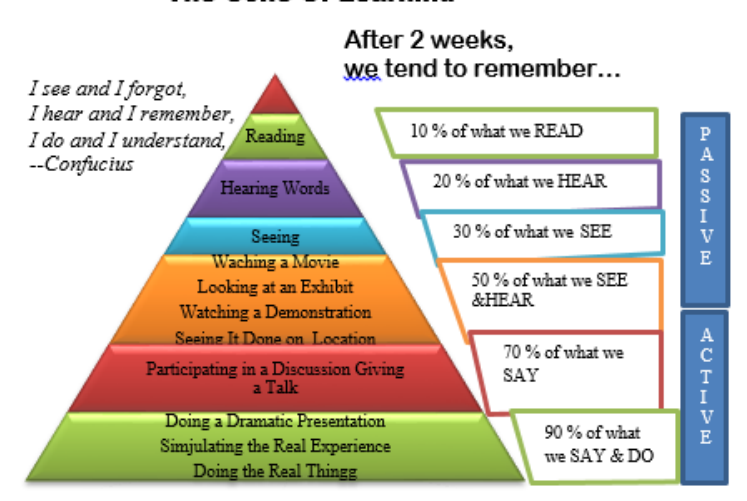
Figure 3. Edgar Dale's Cone of Experience (Davis & Summers, 2015).