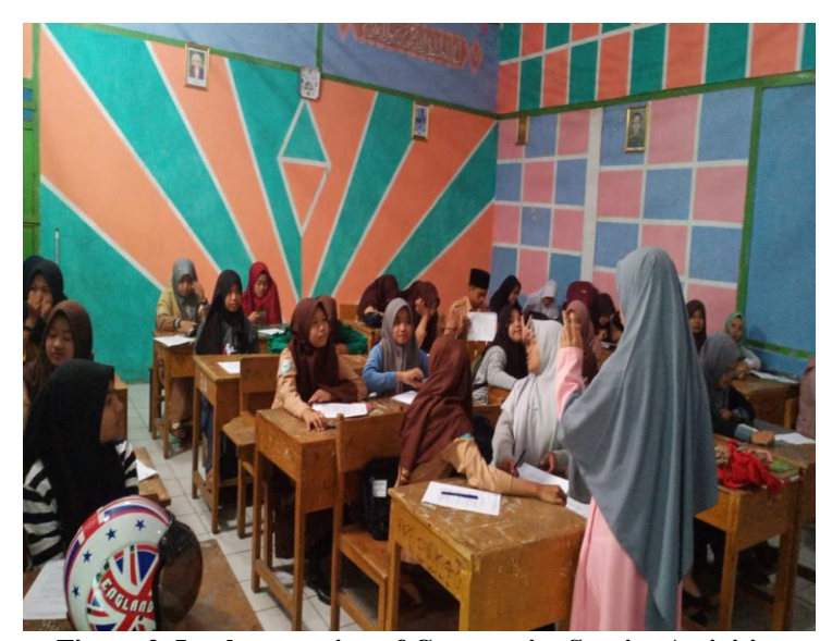
Figure 2. Implementation of Community Service Activities

From the results of the pretest and posttest that have been given by the servant, it can be seen that there is a significant effect of increasing the students' pretest and posttest scores in learning English and also planting character values. The students mean score in pretest and posttest were 65 and 79. Students also more active, independent, brave, responsibility, discussion, polite when they studied in the classroom. This Community Service activity not only provides free tutoring for underprivileged children but also helps the school within the limited facilities and infrastructure in learning, especially in learning English. The equipment provided by servant in helping facilities and infrastructure in MAN Rejang Lebong Regency is in the form of