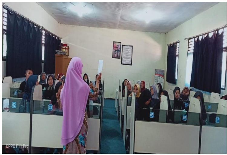
Figure 1. Implementation of Community Service Activities