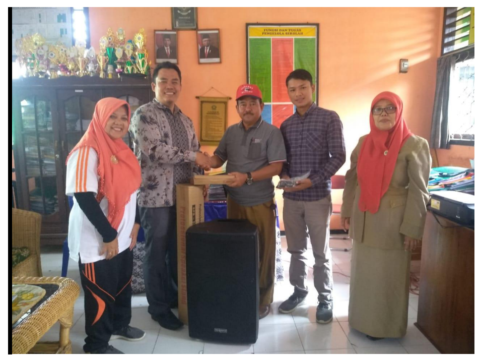
Figure 3. Give the Facility for MAN Rejang Lebong