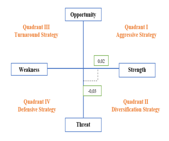
Figure 1. Result of SWOT

The results of IFAS and EFAS are used to determine the position of the quadrant. Strengths and weaknesses produce the X-axis, namely X=1.93-1.71=0.21, and the Y-axis is an opportunity - a threat, namely Y=1.04-2.12=-1.08 to produce a quadrant as shown in Figure 1 following.