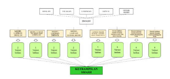
Figure 2. Smash Exercise Model Design

The development of the sepak takraw smash exercise model based on training aids contains 8 smash materials, namely (1) Exercise prefix / smash steps, (2) Leap motion, (3) Blow accuracy training exercises, (4) Model hanging ball smash training (fixed hanging ball), (5) smash training with variations in ball position area (loose hanging ball), (6) smash training model with variations in position and target area (loose hanging ball), (7) smash training model with variations in height of the ball (hanged off with a target) (8) Smash training with toss.