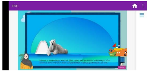
Figure 3. Animation impact of global warming.

viewed through the text presented, in contrast to the causes of human intervention by selecting the icon displayed on this page to find out the cause and further explanation. In addition to text explanations, there are also video and audio animations that are designed to take advantage of the use of animations, transitions and several supporting menus on PowerPoint. The audio contains material that is more concise than written explanations.