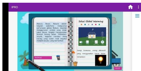
Figure 4. Explanation writing solution of global warming.

This animated snippet shows the impact of global warming which is displayed with an animation along with an audio explanation. The impact of global warming contains material with the contents of melting glaciers, extreme weather accompanied by its effects such as drought and flooding in parts of the world, besides that sea level increases. The real impact on humans is crop failure, the spread of disease for humans. This explanation is expected to help humans understand that global warming has a fatal impact on everyday life.