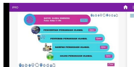
Figure 2. Explanation menu IPRO of global warming.

In the main menu there are several choices, including global warming material which contains the definition of global warming, the causes of global warming, the impact of global warming and also the solution to preventing global warming. In addition, to complete the information, there is also a media developer profile along with instructions for using IPRO media.