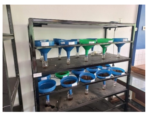
Fig. 2. Berlesse funnel

The data source for this research uses primary data. Primary data is research data obtained from direct data collection. Data was obtained by randomly taking land in the coffee plantation area. A sampling ring was used in this study to equalize the weight and amount of soil taken. Ten soil samples were taken from each area, and then the soil samples were placed in a bottomless funnel for one month with a light period of 12 hours in light and 12 hours in darkness. The holding bottle, the bottom of the funnel, is filled with 70% alcohol to preserve the samples arthropods. Next, the were identified based on morphology with the identification key of Borror et al. (1996). They counted the numbers and recorded them based on genus, family, and ordo, and it calculated and then matched based on the diversity, dominance, and evenness index.