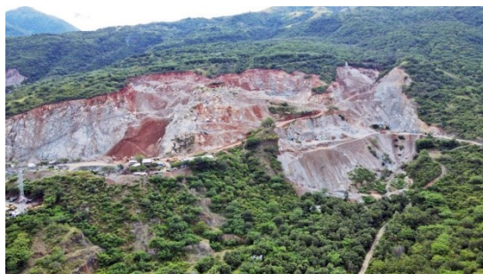
Figure 1. Environmental degradation in IKN (Source: Tempo.co).