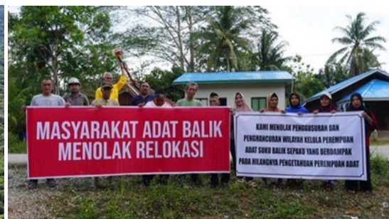
Figure 2. One of East Kalimantan’s indigenous tribes refusing the plan.