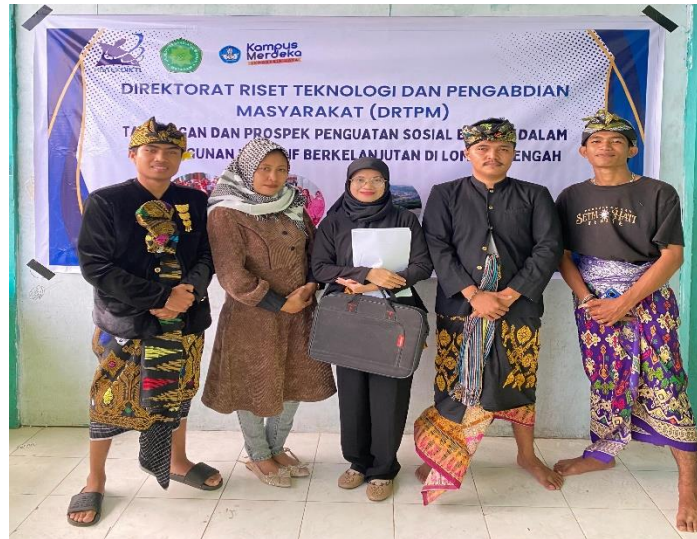
Figure 4: Community-based cultural approach (2)

Community-based tourism approaches can help preserve local traditions by making them part of tourist attractions. Thus, local traditions are seen as cultural heritage and economic assets that can be developed sustainably. (Warsilah 2015)