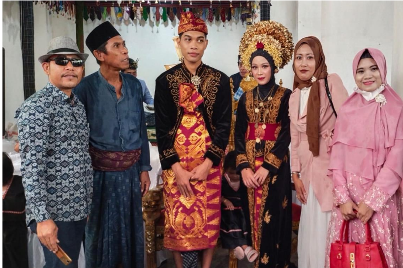
Figure 3: Community-based cultural approach (1)