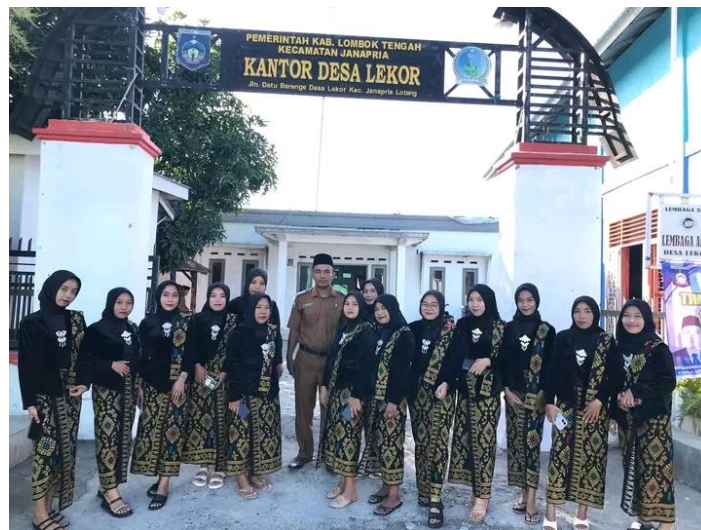
Figure 4: Government policy support

Local governments are essential in supporting socio-cultural strengthening through inclusive policies (Marbun, 2023). The government must ensure that every development program in Lekor Village considers cultural aspects and local community participation. One example of a policy that can be implemented is incentivising tourism and creative economy business actors who prioritise local cultural values.