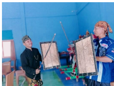
Figure 2: Revitalization of Local Wisdom Through Creative Economy

Culture-based tourism can be essential for preserving local traditions, provided local communities are actively involved in managing and developing tourist destinations. This can strengthen the community's cultural identity and provide significant economic benefits through increased income from the tourism sector (Najma Ajmala Nisya Yurico et al. 2024).