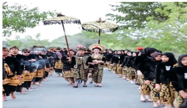
Figure 1: Cultural Tourism Potential

Despite facing various challenges, Lekor Village has great potential in developing cultural tourism based on local wisdom. One of the main strengths that can be utilised is the diversity of traditions and arts still alive in the community, such as traditional dances, gamelan music, and handicrafts. This potential is an excellent opportunity to develop culture-based tourism that attracts tourists and can be a new source of income for village communities.