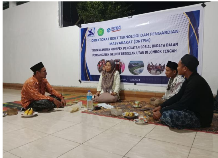
Figure 5: Collaborative support in FGD (Focus Discussion Group) activities

and private sector in managing culture-based businesses. (Masruchiyah and Laratmase 2023)