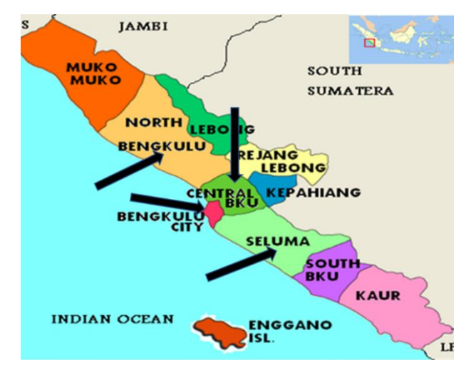
Figure 1. Map of Bengkulu Province (arrow indicates the location of the research)

Furthermore, the map of the study sites where respondents are domiciled can be seen in Figure 1 below: