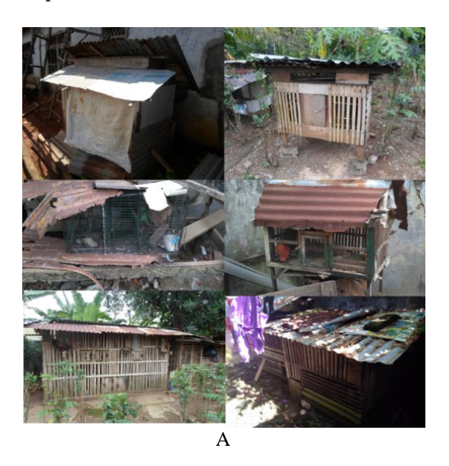
Figure 3. Coops for Red Junglefowl owned by the respondents. Common Coops (A), Rooster coops (B), Hens Coops (C), and Chicks Coops (D)

The coops owned by the respondents vary greatly and almost every respondent had a different and very simple coop. Most coops for roosters were in the form of perch next to the respondent's house. In Figure 3 below can be seen various coops owned by the respondents.