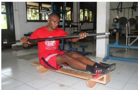
Figure 1. Implementation of the Balance Test

with the correct rhythm according to the metronome; dan (6) Perform 2 attempts, and record the greatest number of strokes that can be done for 1 (one) minute.