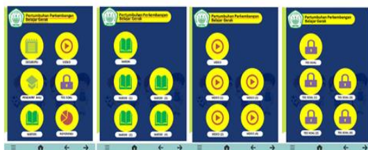
Fig 3. App View

At this stage, the product is made based on the results of the study and the initial design of teaching materials. The sequence of this stage is: preparing the solubility product and solubility product, doing dubbing, making or collecting several learning videos, making animations, and making software/multimedia programs (products). The results of the teaching materials that have been developed are presented in the application display and can be seen in Figure 3 below: