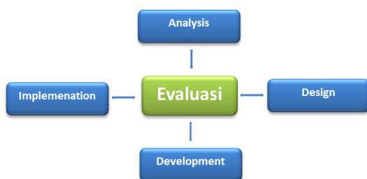
Fig 2. ADDIE Model Research Steps

Research and development is a type of research with the development of teaching materials for the development of motion learning as the object of research. ADDIE is the research model that the researcher chose because it is practical and valid (Mitha Frilia et al., 2020), (Nurhalimah et al., 2017) There are five stages in this model, namely analysis, design, development, implementation, evaluation (Castro & Tumibay, 2021).