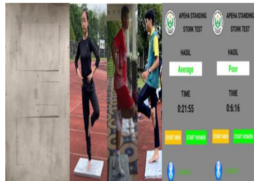
Figure 2. Research Final Product

standing stork test android-based which can later be used by coaches and athletes, especially in the province of North Sumatra and add treasury test and measurement tools in the neighborhood Faculty of Sports Science Unimed. The final product has gone through a series of development paths so that it becomes a product of test and measurement tools standing stork test based on android, namely as follows: