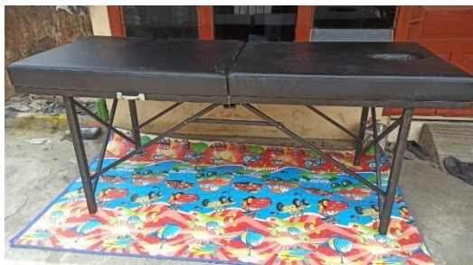
Figure 2. Bed Massage Portable

The portable massage bed model can be used by masseurs as an alternative to the massage bid model that can be used because it can be adjusted to the patient's comfort. In addition, this portable massage bed model can make it easier for their massager to be moved and can be folded. The advantage of this portable massage bed is that it can be carried anywhere and has ergonomic value and is much lighter than a permanent massage bed. This portable massage bed development model is highly recommended for massage clinics because it can be adapted to their needs of the clinic.