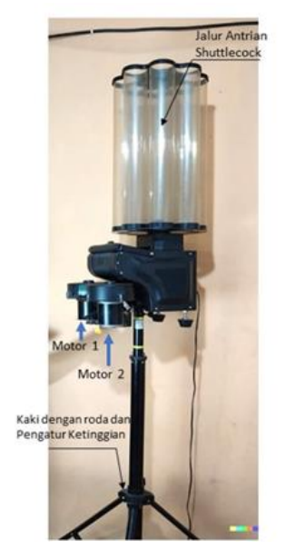
Fig 3. The final product of the Shuttlecock Throwing Tool

Control is carried out remotely with six shuttlecock throw positions. The position of 1 set of exercises can be adjusted according to your needs, and the pattern can be saved. Here are the final product results.