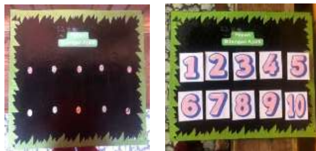
Figure 2. Draft Model after Revision

Material experts and media experts validated the initial product. The validation results showed scores of 90% (material experts) and 95% (media experts), indicating very suitable