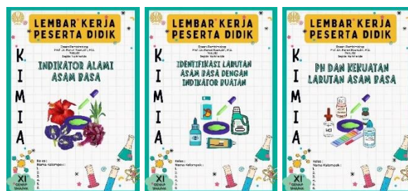
Figure 2. Student Worksheet Cover Design

The design stage involves creating the learning tools and instruments, such as student worksheets, from the beginning. The educational resources and tools created in tandem with worksheets are syllabus, lesson plans, and critical thinking skills tests consisting of 15 questions. The preparation of LKPD needs to be mindful of how language and content are presented, as well as how colors and designs are chosen to pique students' interest in learning and inspire them. The created worksheets have 3 titles, each of which is an A4 sheet with 13 to 14 pages.